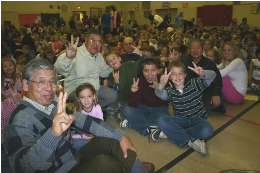
(Getting to know the elementary school students.)