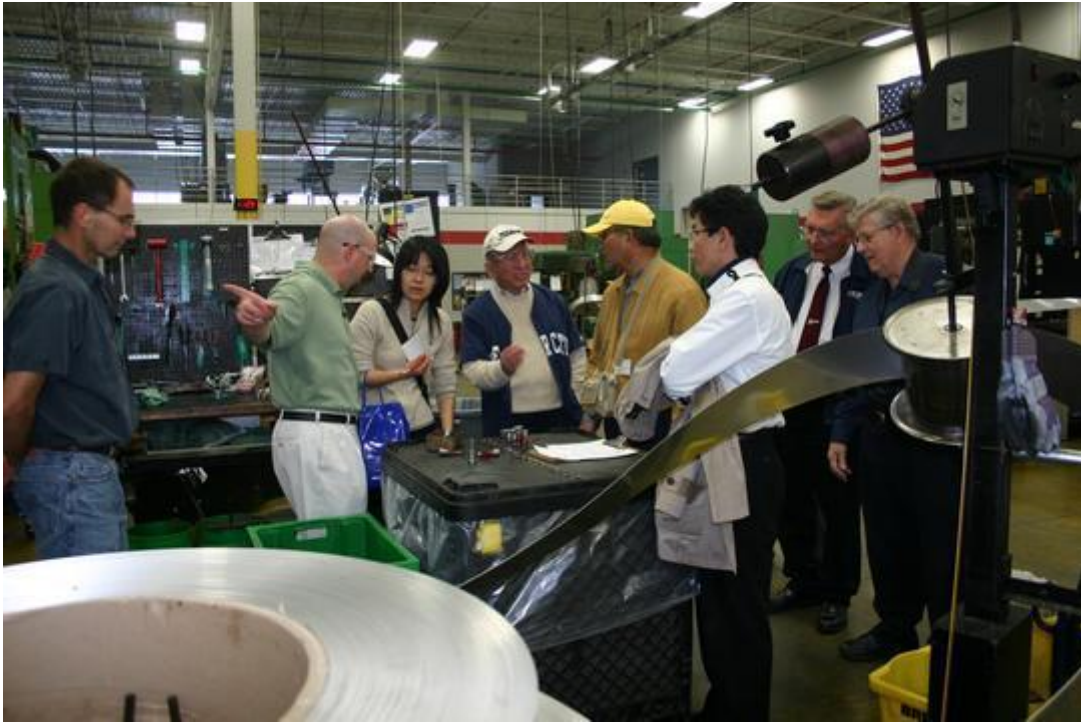
(Visiting a stamping factory.)