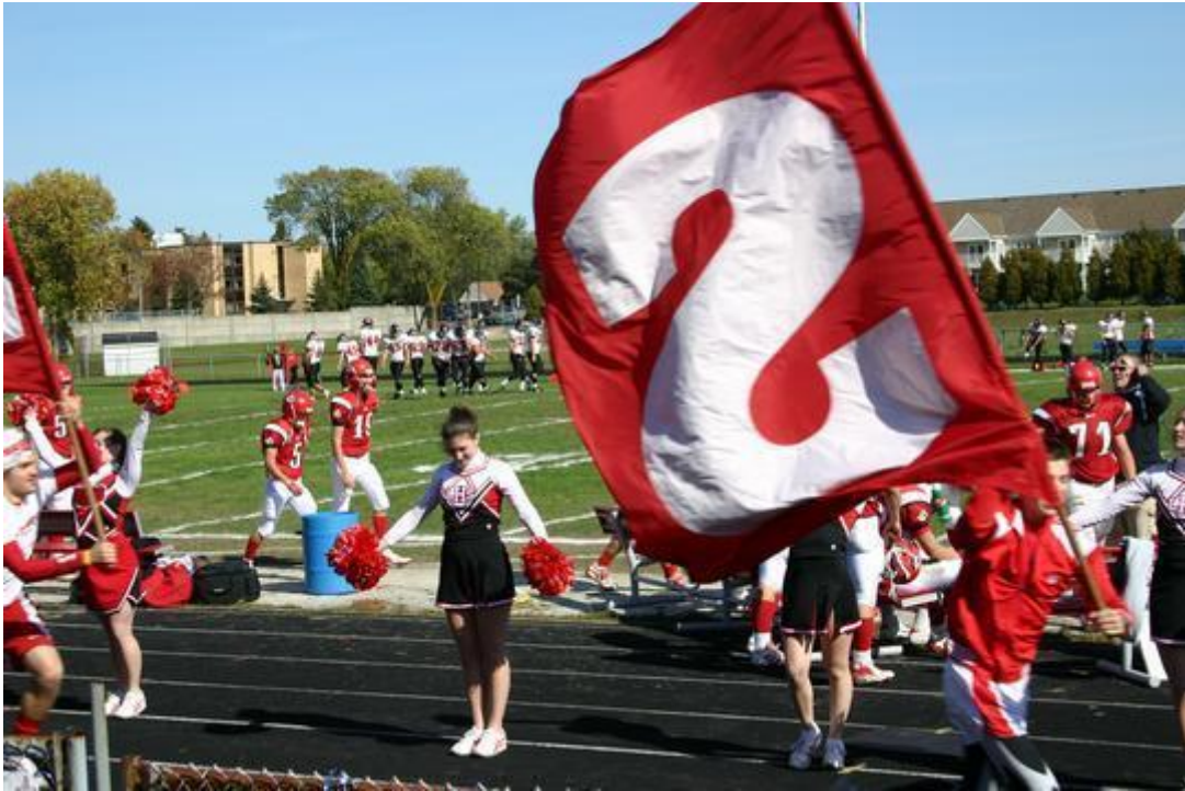
(Halftime show at a high school's homecoming football game.)