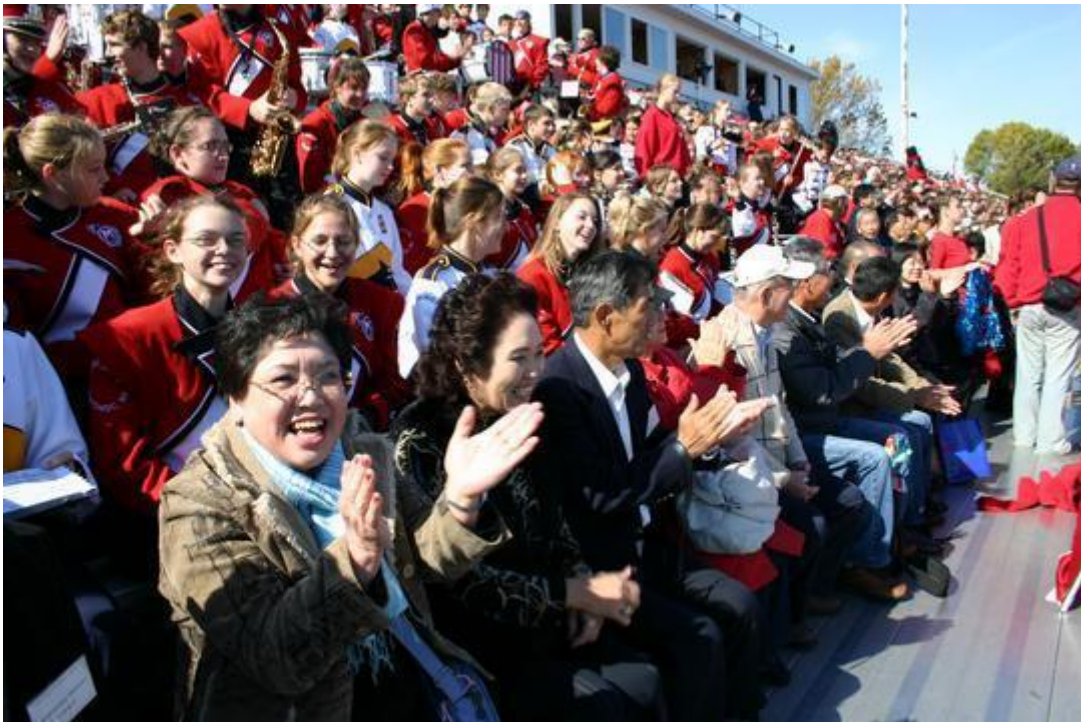
(Everyone excited at watching American football for the first time.)